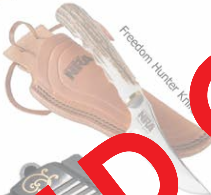
Freedom Hunter Knife