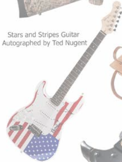
Stars and Stripes Guitar Autographed by Ted Nugent