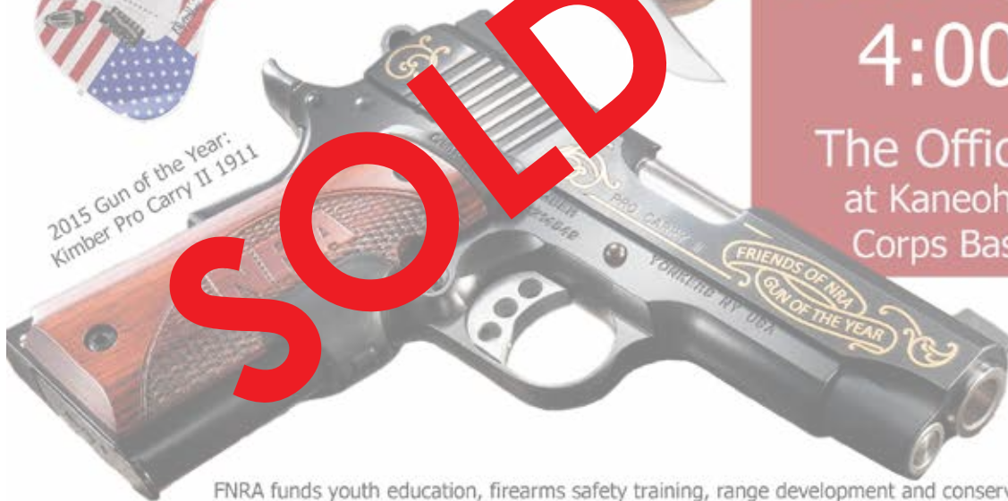
2015 Gun of the Year: Kimber Pro Carry II 1911

Games - Door Prizes Special Drawings Limited Edition Firearms Live Auction Silent Auction Custom Knives Exclusive Art Specialties Merchandise