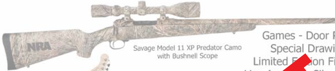
Savage Model 11 XP Predator Camo with Bushnell Scope